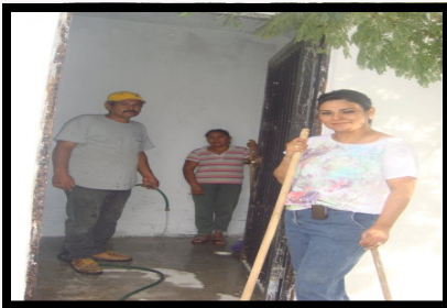
Teacher, community members working on facility