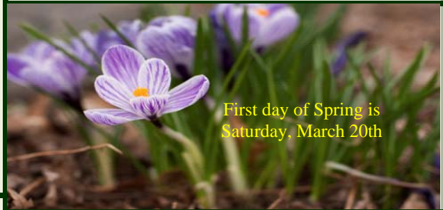
First day of Spring is Saturday, March 20th