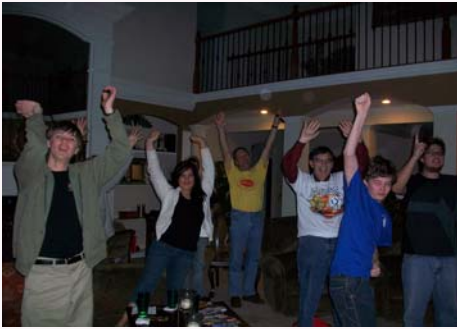
TOUCHDOWN! Geaux Saints!